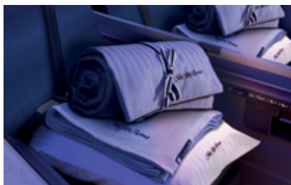
Custom luxury bedding designed by Saks Fifth Avenue