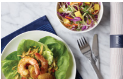
Inflight dining experience created with The Trotter Project