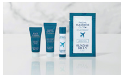
Sleep-themed amenity kits help flyers stay relaxed and refreshed